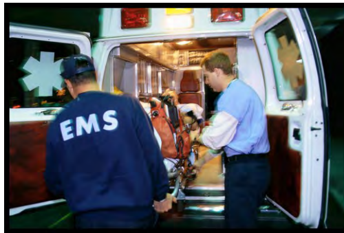
Fo. Co. EMS established a new fund in 2010 to assist in obtaining funding for a new building.

Provides support for the operations for the Wabash Senior Citizens (Friendship Circle Center) of Covington.