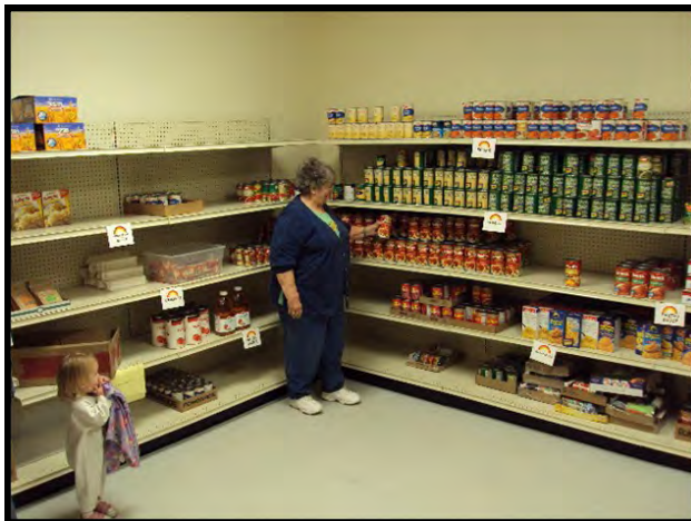
Covington Food Pantry

For more information about educational or scholarship awards visit www.wicf-inc.org .