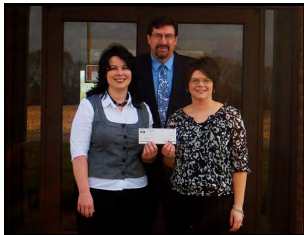
Fountain County Learning Network received a grant for GED classes

One original copy of the proposal should be provided. The Foundation will review the grant request and contact the applicant for any additional information needed or any clarification of the project. In some instances, the Foundation will make a “site visit” to the applicant.