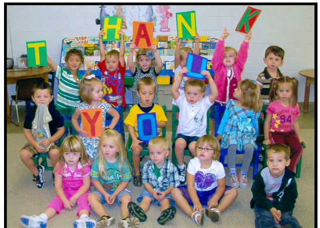
Covington Nursery School