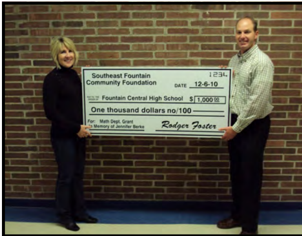
Fountain Central High School Math Department

Friends of the Veedersburg Public Library - $550 Summer Reading Program.