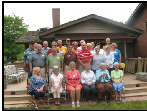
CHS Class of 1960 established a new fund in 2010.

To provide grants for meeting the changing needs of the Covington community.