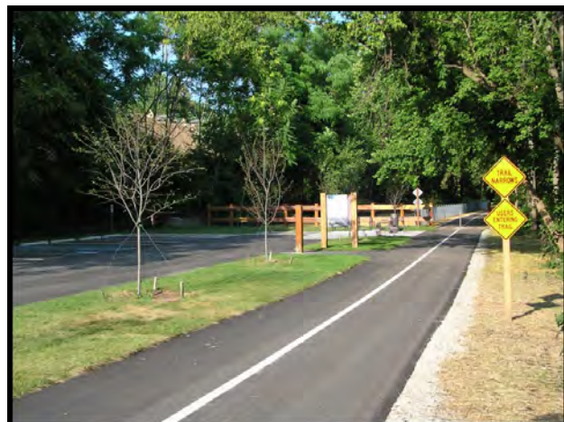
Trailhead on Phase 2 of the Covington Circle Trail

County-wide mentoring services to youth.