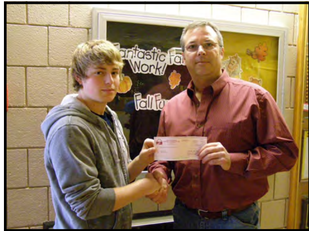
A.S.K. Food Pantry/Attica Turkey Trot

Scholarships for contestants and fair expenses.