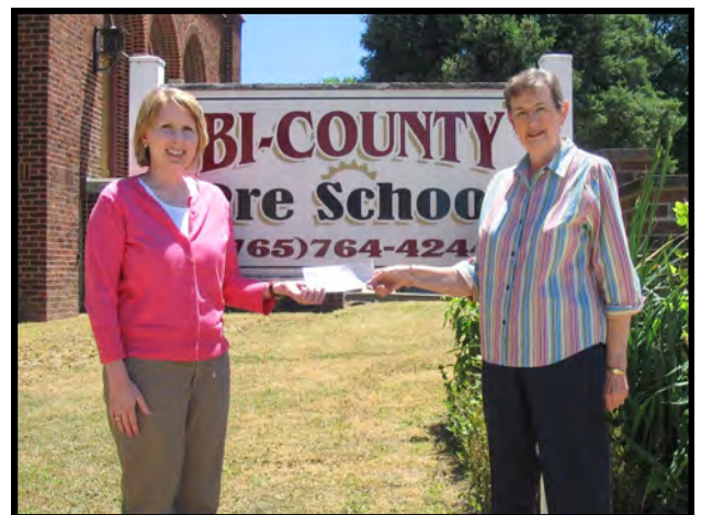
Bi-County Preschool received a grant.