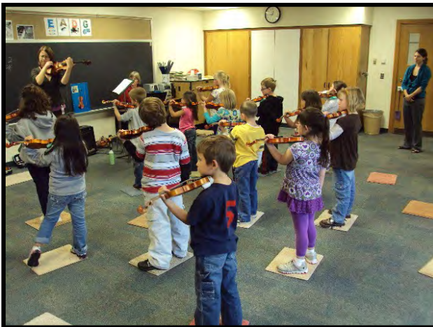
Attica Elementary School Violin Project

Supplies to paint 128 Attica fire hydrants with the personality of the artists' choice.