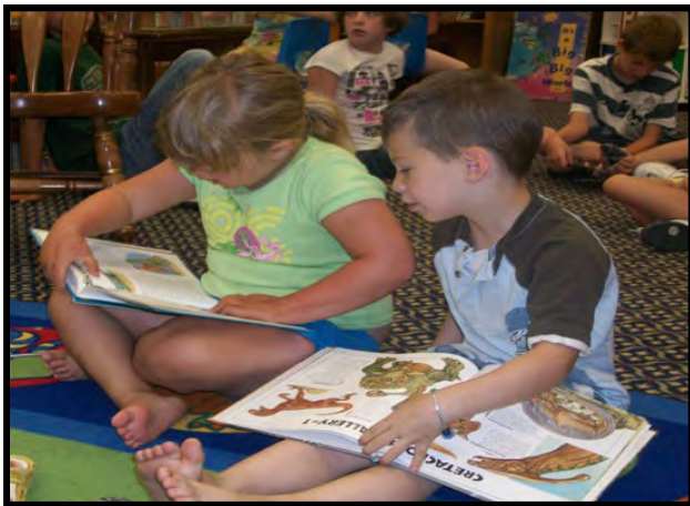
Veedersburg Library Summer Reading Program

"Hoosiers Summer School" - 60 4th & 5th graders take day and overnight trips and visit historical sites throughout Indiana.